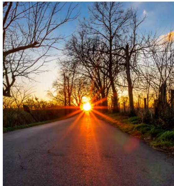
The sun sets on a Kentucky back road.

Our power grid gets billions of electrons from point A to point B. No traffic jams. No accidents. Every home and business in the communities we